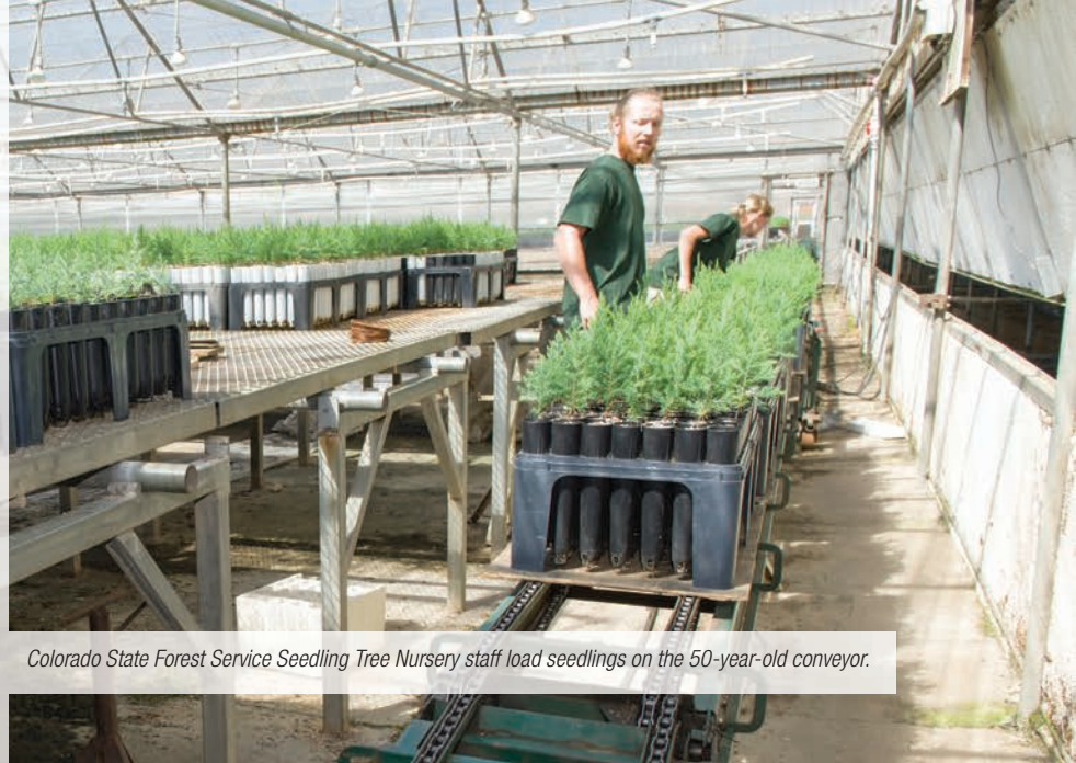
Colorado State Forest Service Seedling Tree Nursery staff load seedlings on the 50-year-old conveyor.

The problem: A 50-year-old conveyor belt at the Colorado State Forest Service Nursery, used to transport hundreds of thousands of seedlings through 18,000 square feet of greenhouses, kept breaking. The solution: The innovative minds of CSU engineering students, who spent seven months designing, building, and installing a brand-new, monorail-inspired seedling transport system for the nursery as part of a senior design project. The Forest Service nursery provides native species of seedling trees, shrubs, and perennials to landowners at low cost to assist with conservation efforts, including reforestation after fires, erosion control, and enhancing wildlife habitats. Order seedlings via http://csfs.colostate.edu .